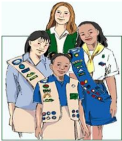
Girl Scout Sunday

Please join us on March 12 th as we honor our Girl Scouts! We host Jr. Girl Scouts #42123 and Girl Scout Troop #43209.