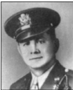
Reverend George L. Fox

Four Chaplains Memorial Foundation © 2015