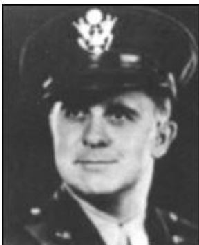
Reverend Clark V. Poling