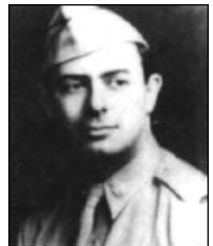
Rabbi Alexander D. Goode